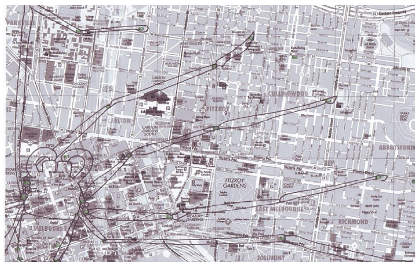
Hunstman constellation connecting post offices in North East Melbourne.

...two farmers who were concerned about what is happening to the country and why. The first, from Western Australia, spoke of our current approach: 'I spend most of my time working with plants and animals from somewhere else that just want to die, while spending the rest of my time getting rid of plants and animals from this country that want to live here!' The second, from Queensland, reflected on the past: 'If it had been Australians who settled in England, do you think we would have chopped down all the oaks, killed all the sheep, cattle and horses and introduced eucalypts, kangaroos and emus?'